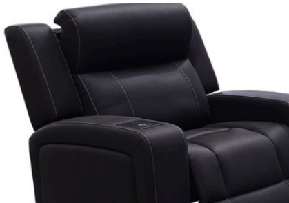
Optimal angle with control